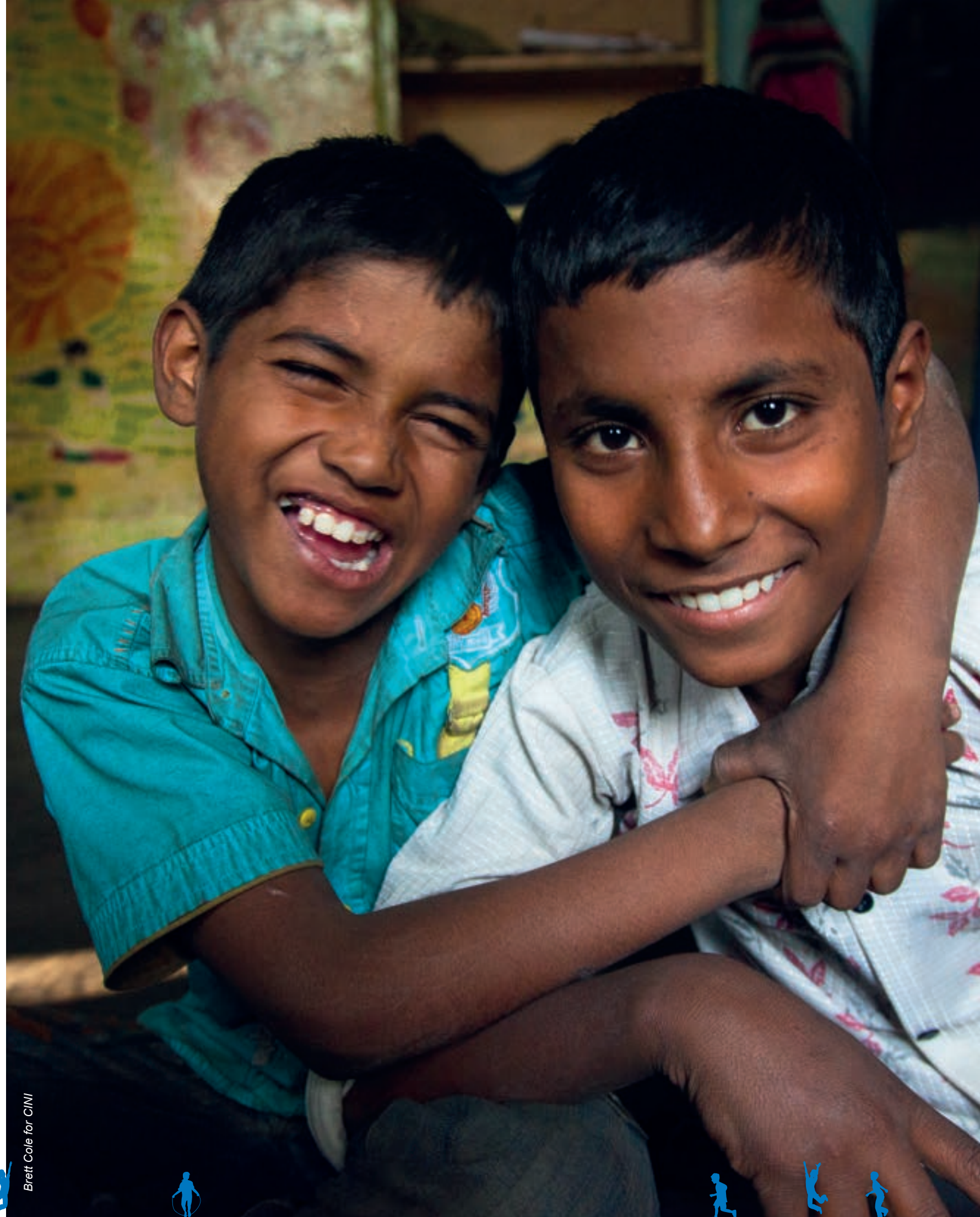
Brett Cole for CNI

Note: Throughout the annex, “children” refers to the under 18s who participated in the consultation events. “Young adults” and “youth” refer to the over 18s (mostly aged 18-23) who participated. “Young people” refers to both children and young adults.