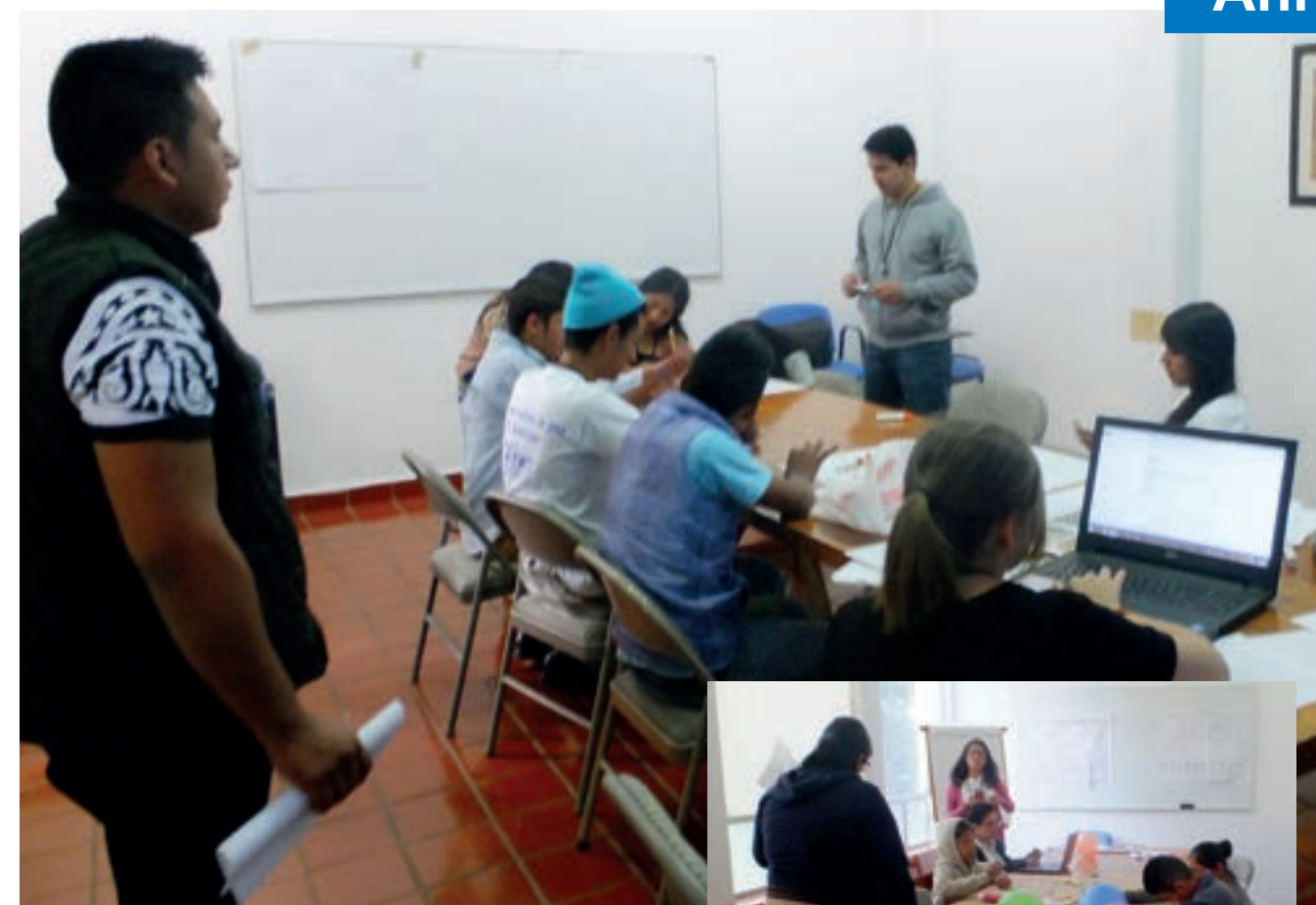
Photos from consultation in Mexico

The consultations were jointly organized by Consortium for Street Children ( www.streetchildren.org ) and Growing up on the Streets, supported by StreetInvest ( www.streetinvest.org ), in partnership with University of Dundee, and funded by Comic Relief.