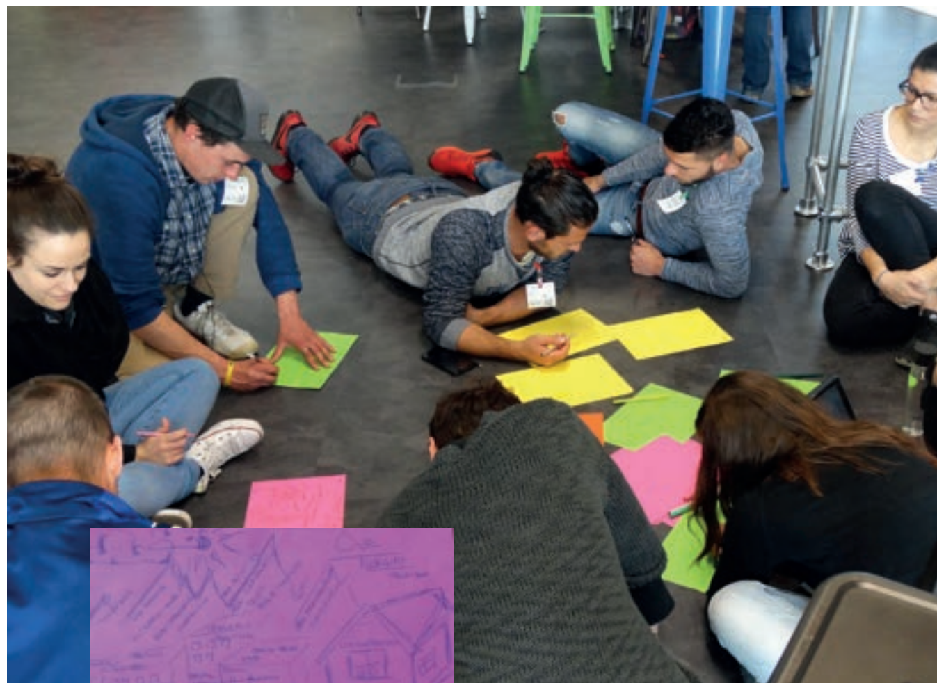
Photos from consultation in Europe